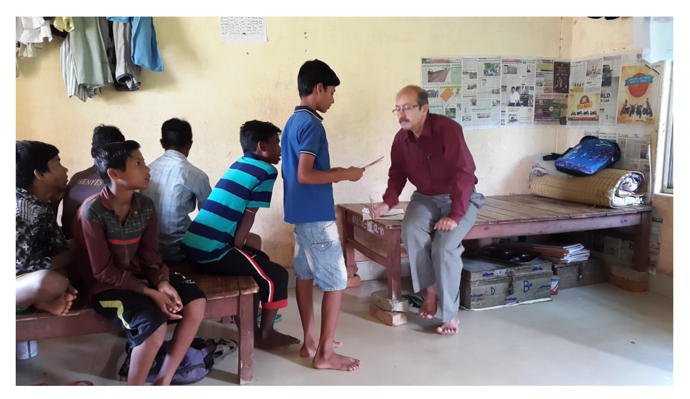
Member Secretary Interacting with the children of Utkal Balashram, Balasore