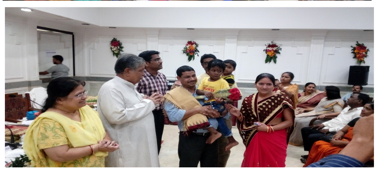
Guests and Dignitaries in the Adoption Awareness Day