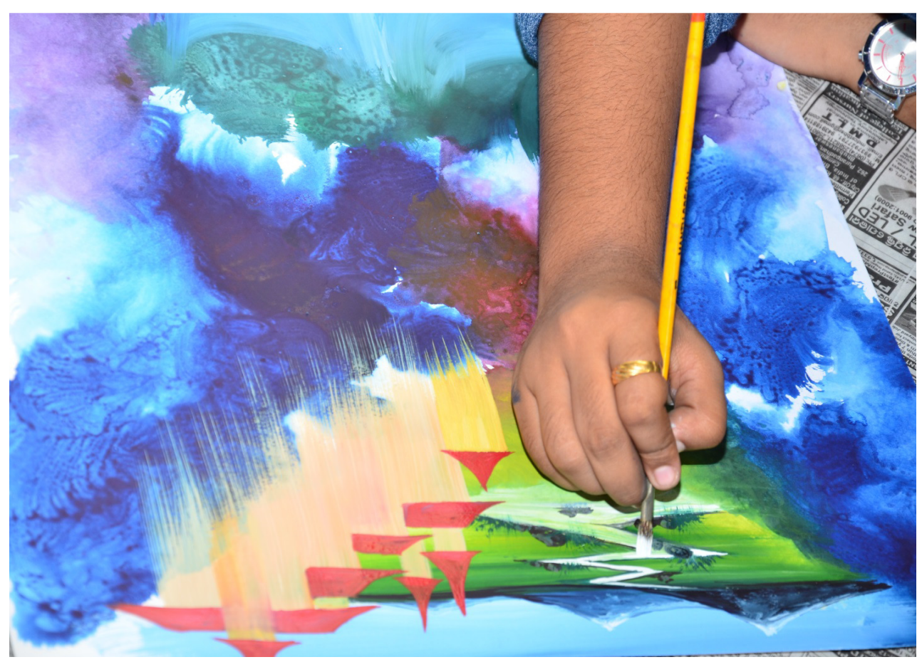
Beautiful paintings created by the child participants