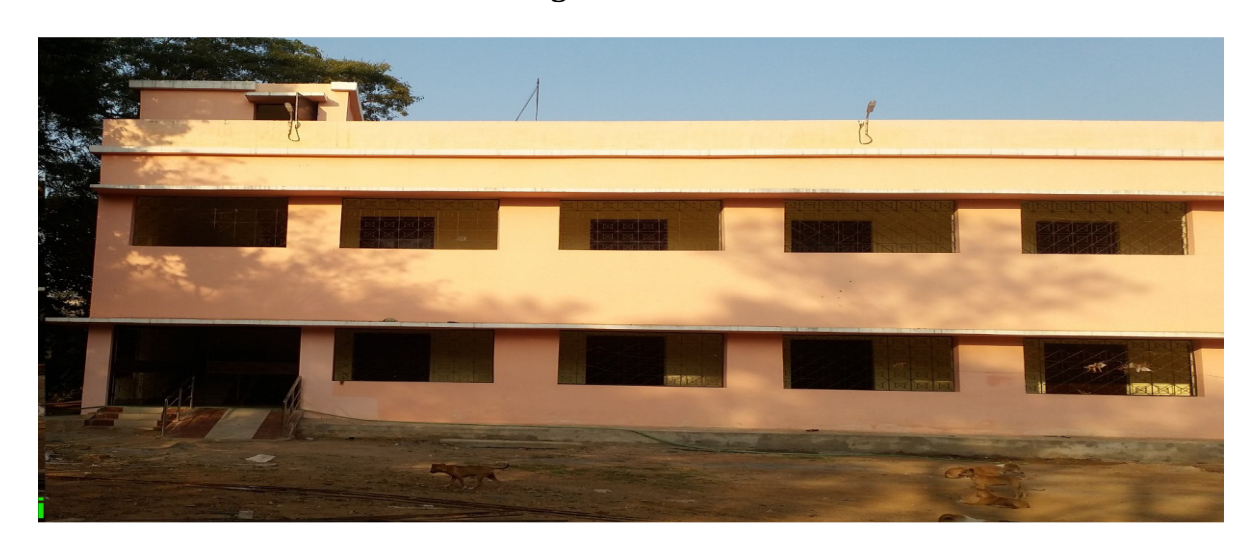
New Building of AWTC Unit-II,BARIPADA