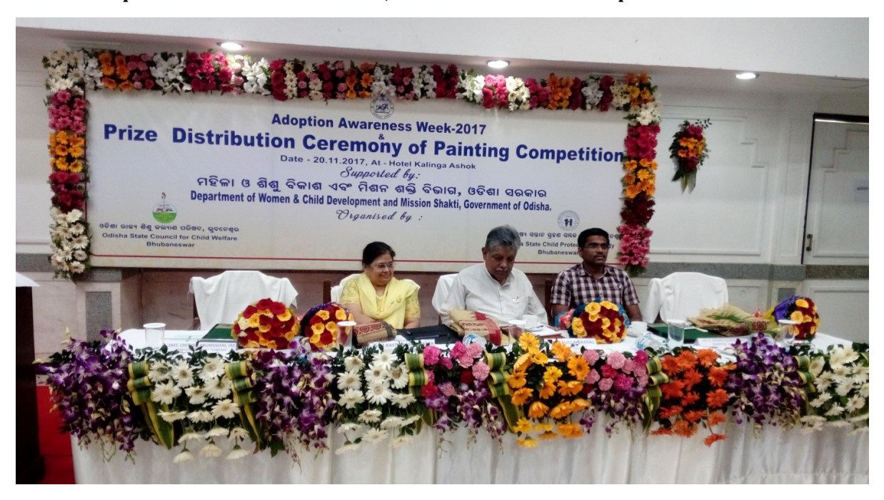
Guests and Dignitaries on the Dais